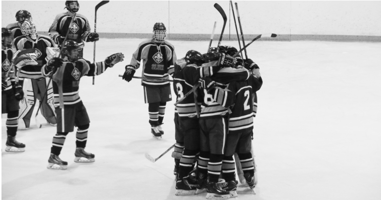
The team celebrating a 2-1 victory against De Smet last Friday night.