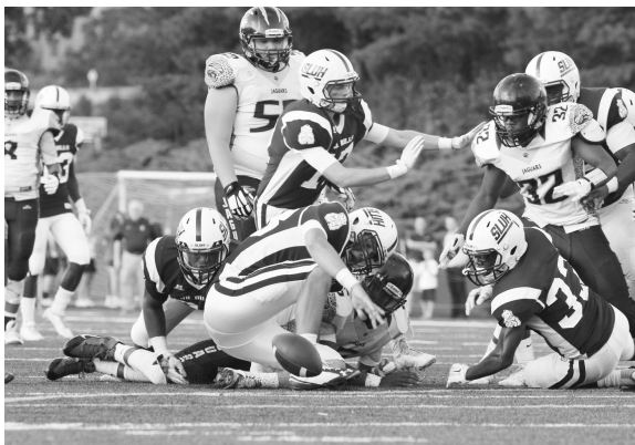
The Jr. Bills scrambling for a fumble against Gateway STEM last Friday.