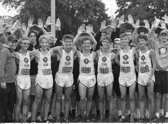
XC varsity after their second place finish

Come raceday, the varsity finished second among the 23 teams racing in their division. ranked team in the state, Rock-