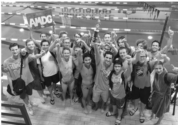
The swim team after its victory at Marquette Relays.