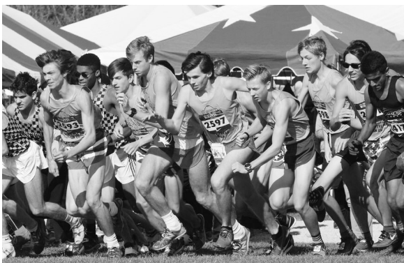
SLUH at the start of the open race.