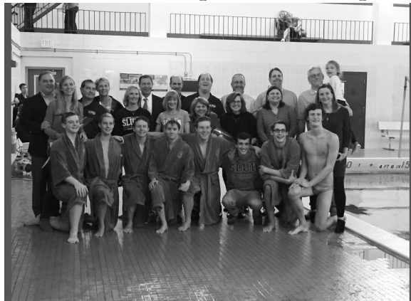
SLUH senior swimmers and their parents on Senior Night.