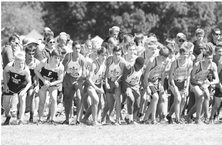
Betwixt Farnington and Kearney, the SLUH varsity racers ready themselves before the Forest Park XC Festival begins.