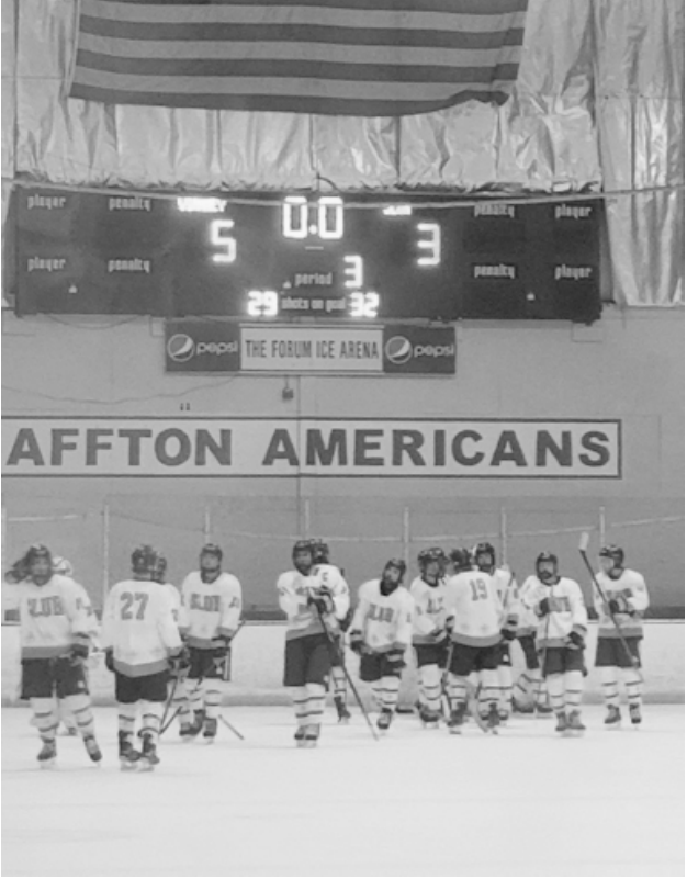
Players Saturday night after 5-3 loss to Vianney.

However, less than a minute later, Sextro redirected a puck shot on net, which