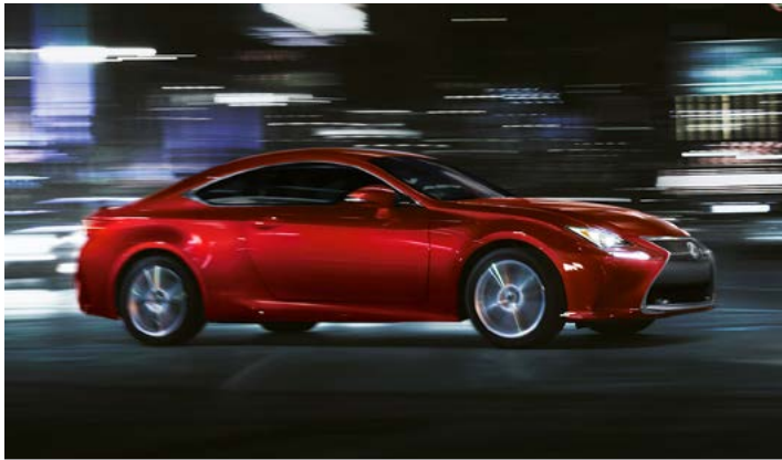
THE SHOOTOUT CAR, A LEXUS RC *

Each golfer will have eight chances to win a brand new Lexus , and someone is guaranteed to drive home in a new Lexus RC!